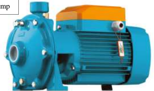
City ICB Pump

IC50 = 1" Female BSP suction and delivery. IC100 = 1" Female BSP suction and delivery. ICB100= 1.25" Female BSP suction, 1" delivery. IC150 = 1.25" Female BSP suction and 1" delivery. ICB150 & ICB200= 1.25" Female BSP suction and 1" delivery.