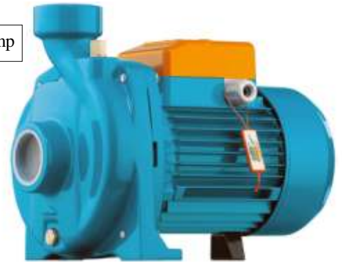
City IC Pump

Centrifugal electric pumps capable of pressurising and delivering large volumes of water and other non-aggressive liquids. Used in domestic, industrial and agricultural/horticultural applications. IC Pumps are single stage, ICB have double impellers.