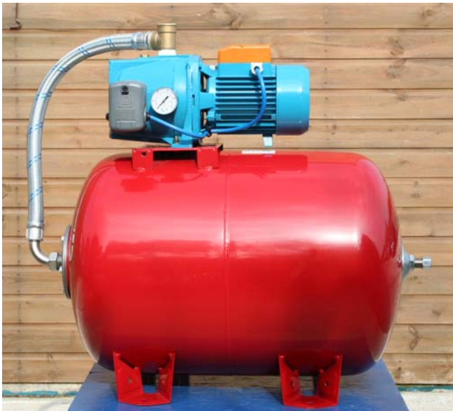
City JS150 mounted above a 100 litre Horizontal pressure vessel.

These compact pressure sets will increase the pressure of potable or clean water for many uses such as domestic or agricultural water supply, irrigation, car washing or connecting to industrial process machines after a type 'A' air gap has been generated. It's simple to install with only three connections, (plumbing water too and from the unit and making the electrical connection). The versatility and quietness of these units lends themselves to 1001 uses, all being economical to run and inexpensive buy.