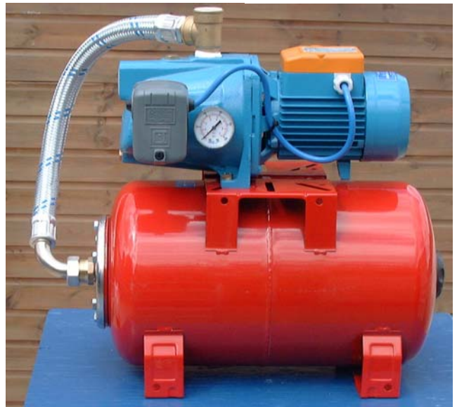
City JS50 mounted above a 20 litre horizontal